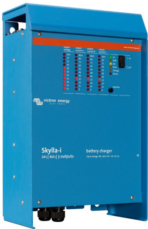
Skylla-i 24/100 (3)