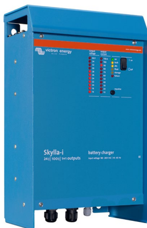
Skylla-i 24/100 (1+1)

To learn more about batteries and charging batteries, please refer to our book 'Energy Unlimited' (available free of charge from Victron Energy and downloadable from www.victronenergy.com ).