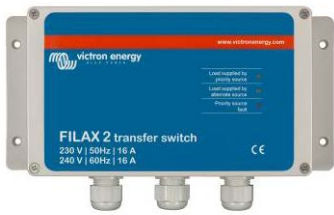
Filax 2: ultrafast transfer switch