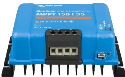
Solar Charge Controller MPPT 150/35