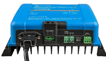
Phoenix Smart 12/50(1+1)