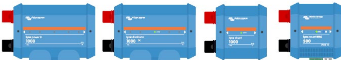
The Lynx modules: Lynx Power In, Lynx Distributor, Lynx Shunt VE.Can and Lynx Smart BMS