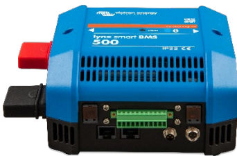
Lynx Smart front angle